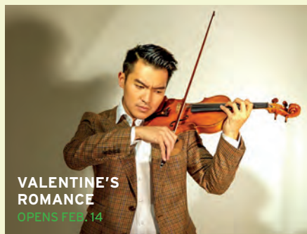
VALENTINE'S ROMANCE OPENS FEB. 14