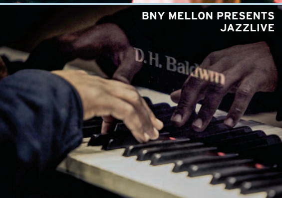
BNY MELLON PRESENTS JAZZLIVE