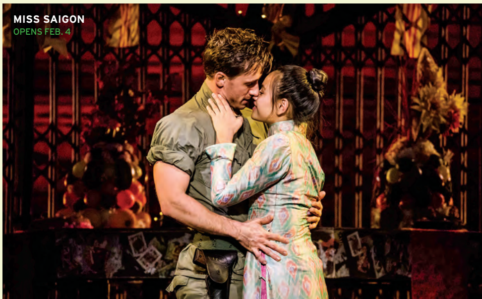
MISS SAIGON OPENS FEB. 4