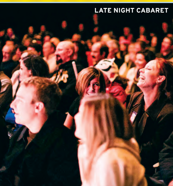
LATE NIGHT CABARET