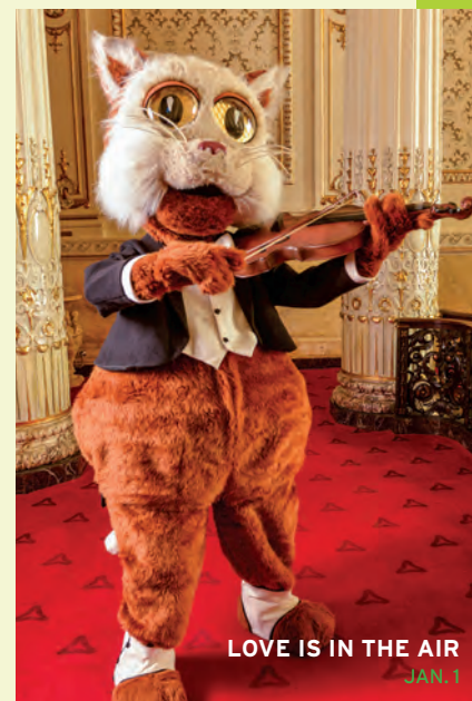
LOVE IS IN THE AIR JAN. 1

Benedum Center / 8 p.m. / Tickets start at $29