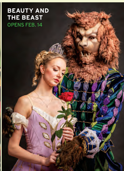
BEAUTY AND THE BEAST OPENS FEB. 14