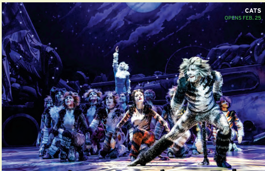
CATS OPENS FEB. 25