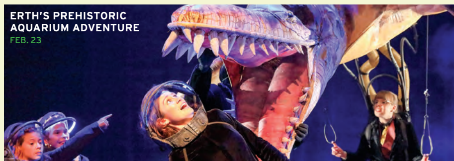
ERTH'S PREHISTORIC AQUARIUM ADVENTURE FEB. 23

Children from the ages of 2 to 7 years old across the world have quickly taken a liking to Blippi's charismatic personality and innovative teaching lessons! In the live show, they will continue to learn about the world around them while singing and dancing along with this one of a kind show.